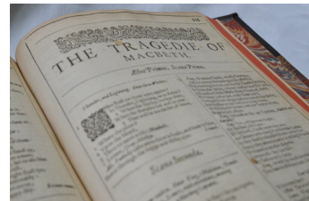
Second Folio of Shakespeare's works, published in 1632 (collection of Trinity College)

Trinity's Second Folio is not in perfect condition: in common with most surviving copies, it has been rebound, its pages have been cropped of their originally generous margins, and it lacks a number of its preliminary pages, for which substitutes from later and facsimile editions have in some cases been tipped in. Its final page (as a letter from an expert assessor in the British Museum to whom Leeper had sent it for authentication points out) has been taken from the Third Folio, the corner of the page having been torn off to disguise what would otherwise be an obvious lack of numerical sequence in pagination.